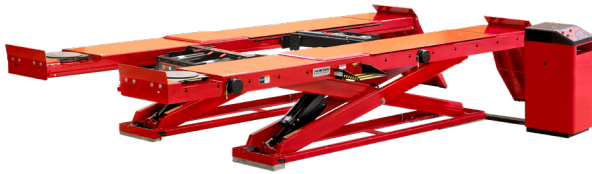
RX55KIS-215E Shown (jacks optional)