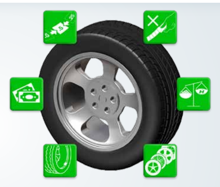
Use less weight. Carry less weight. Balance in less time.

ACCOMMODATE MANY WHEEL TYPES — Flanged or flangeless, plastic clad, colored rims, wider widths, and run flats