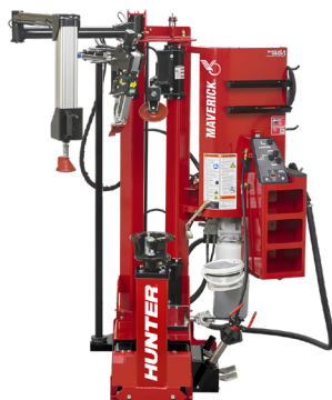
TCM (base model)