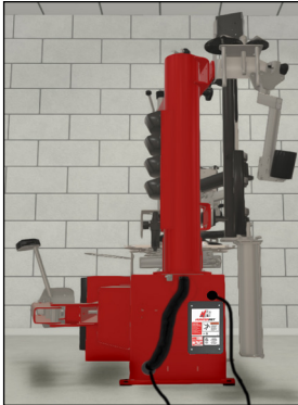
Rear of Tire Changer