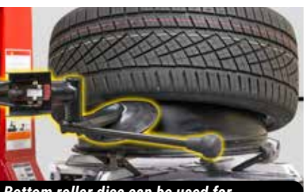
Bottom roller disc can be used for bottom bead reloosening, demounting, or match mounting.