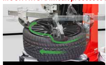
Rising cam action reduces bead stress on top bead mount.