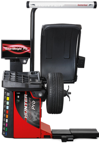
SWP78 with HammerHead option