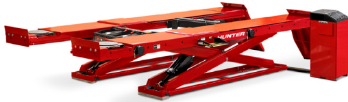
RX45KIS-215E (Jacks Optional)