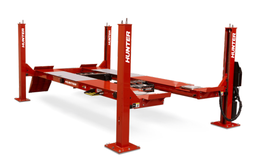
L451 Open Front 4-Post Lift